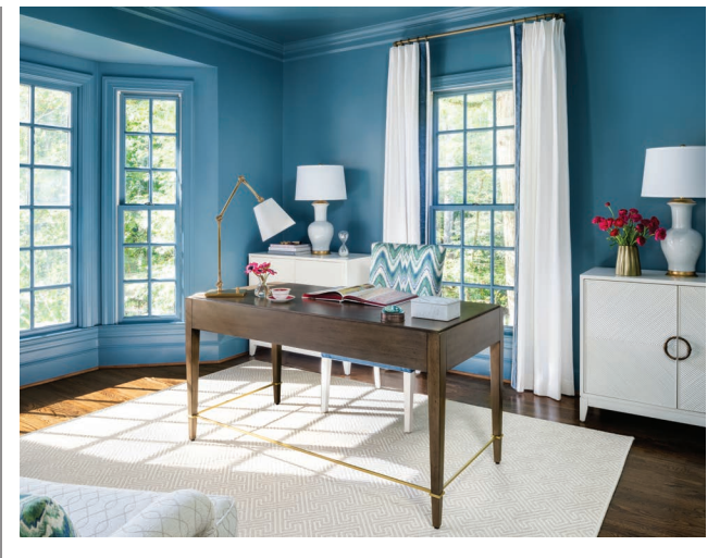
The home office is painted in Refuge by Sherwin-Williams. The desk chair holds a combination of Schumacher and MaterialWorks textiles.

14220 Sullyfield Circle Unit D | 703-498-2121 • abckitchenandbath.com info@abckitchenandbath.com